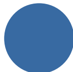
Dark blue 660